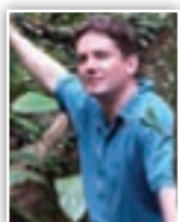
Environmental Systems and Societies