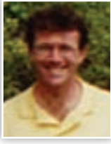
Environmental Systems and Societies