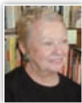
Theory of Knowledge